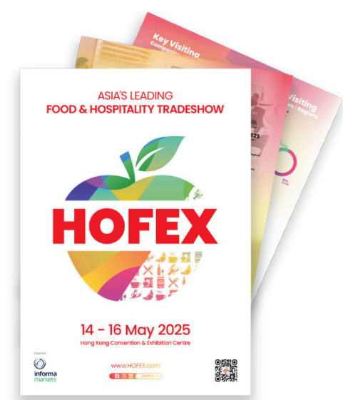
Exhibit Now 立即參展

Looking to enhance your exposure and deliver quality services and products to professional buyers in Asia and international markets ? Secure your stand at HOFEX 2025!